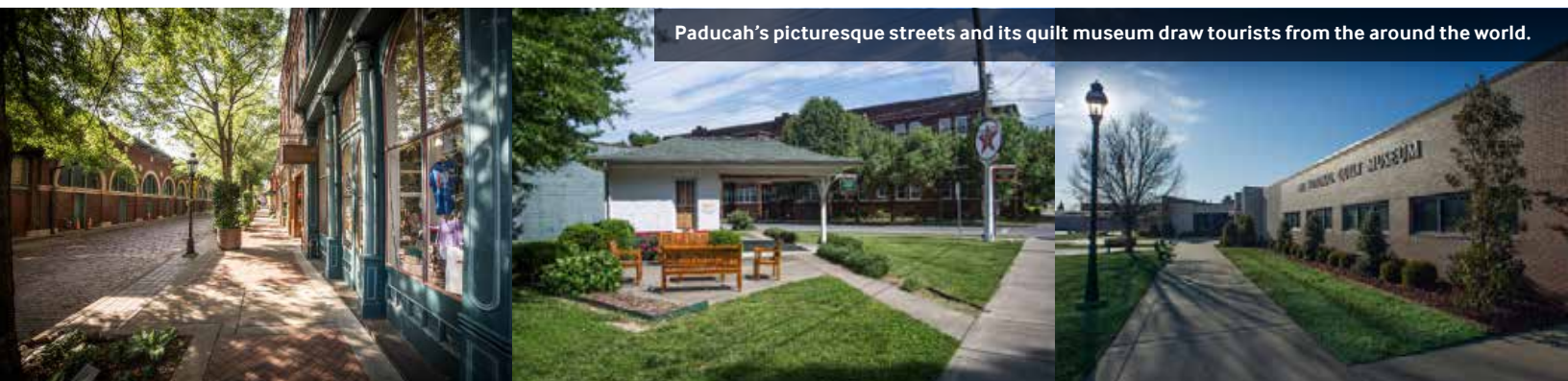
Paducah's picturesque streets and its quilt museum draw tourists from the around the world.

The Medicaid expansion has changed the operations of local free clinics, which have historically limited services to residents who are working but lack insurance. In Calloway County, Angels Community Clinic saw its patient census drop from 600 a year before the expansion to 100 after. "The people who really needed Medicaid seem