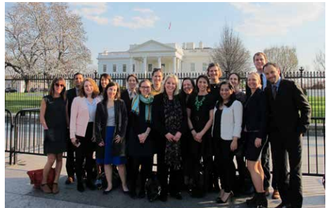
2016–2017 Harkness Fellows in Washington for Policy Briefing.