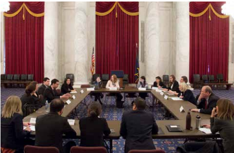
The Fellows meet with Jay Khosla, Staff Director for the U.S. Senate Committee on Finance.

A four-day briefing held on Capitol Hill with key stakeholders—including members of Congress and senior government officials, think tank researchers, political strategists for the Republican and Democratic parties, industry lobbyists, and prominent journalists—highlights the U.S. political process and current issues on the health and social policy agenda.