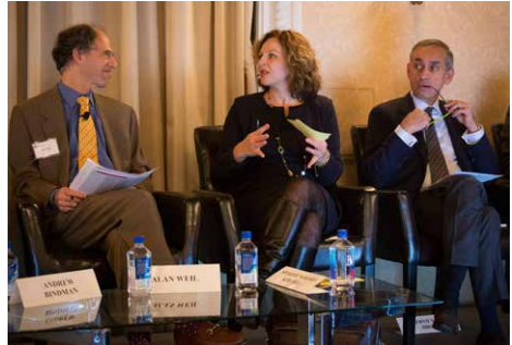
Alan Weil, J.D., M.P.P., Editor-in-Chief, Health Affairs ; The Honorable Edith Schippers, Minister of Health, Welfare and Sport, The Netherlands; Professor The Lord Darzi of Denham, Imperial College of London.

The Commonwealth Fund's Annual International Symposium, held in Washington, D.C., brings together health ministers and leading health policy thinkers from Australia, Canada, France, Germany, the Netherlands, New Zealand, Norway, Sweden, Switzerland, the United Kingdom, and the United States. The meeting is a unique, invitation-only policy forum that fosters high-level cross-national exchange and showcases international innovations.