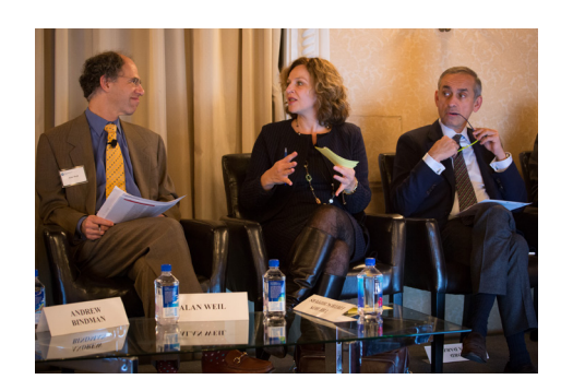
Alan Weil, J.D., M.P.P., Editor-in-Chief, Health Affairs , The Honorable Edith Schippers, Minister of Health, Welfare and Sport, The Netherlands; Professor The Lord Darzi of Denham, Imperial College of London.

The Commonwealth Fund's Annual International Symposium, held in Washington, D.C., brings together health ministers and leading health policy thinkers from Australia, Canada, France, Germany, the Netherlands, New Zealand, Norway, Sweden, Switzerland, the United Kingdom, and the United States. The meeting is a unique, invitation-only policy forum that fosters high-level cross-national exchange and showcases international innovations.