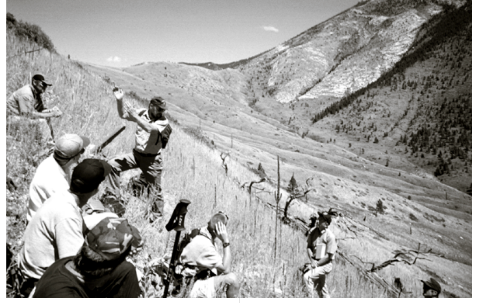
LEARNING FROM DISASTER

A group of students from The Wharton School at the University of Pennsylvania learn vital lessons in teamwork, communication, and improvisation from the Mann Gulch tragedy.