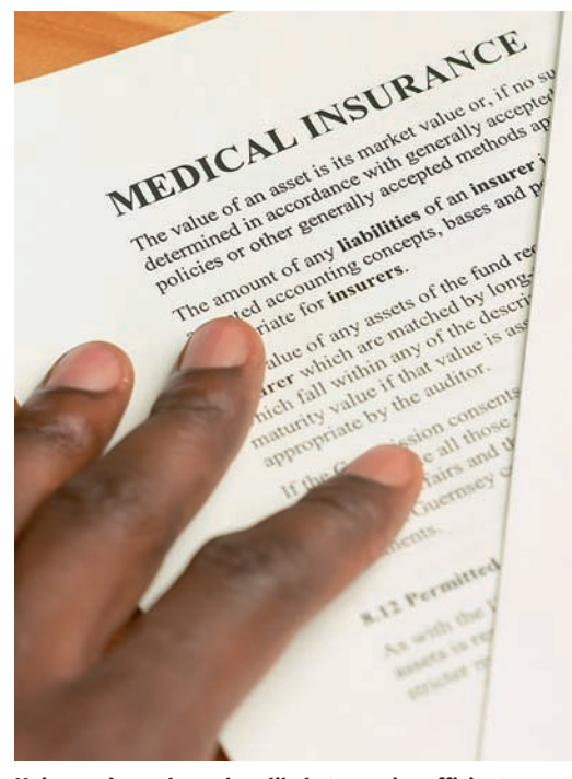
Uninsured people are less likely to receive efficient care

In April 2006, Massachusetts enacted a plan to make cover affordable for all uninsured residents. It adopted the principle of shared financial responsibility, mandating that everyone must purchase health insurance and requiring employers to provide health benefits to workers or pay an admittedly modest $295 a year into a fund to help finance cover. State and federal funds are used to subsidise care for the poor; the Medicaid programme was expanded to cover children from families with an income up to three times the federal poverty threshold. The plan also created an insurance pool for small businesses and individuals. The big question is whether